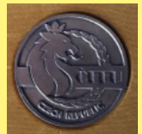
Vsetin International Bronze Medal Winner 2022

Now offer half-price membership. This is a limited time offer so hurry and join now!